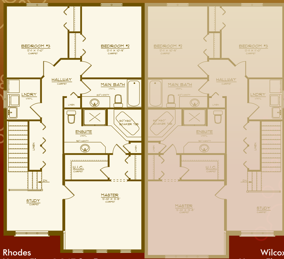
Rhodes Upper Floor 1,147 Sq. Ft.